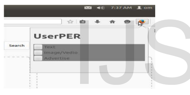
Fig. 4. GUI for extention

We did an introductory implementation for proposed system using Jetpack framework provided by Mozilla. We implement nsiContentPolicy for blocking and unblocking contents on websites. By using this we can observe the content that is being loaded into the browser. This interface is very useful for content-aware plug-in. By using this we can allow or stop user-browsed URLs. For our proposed technique we created a GUI as following fig 4.