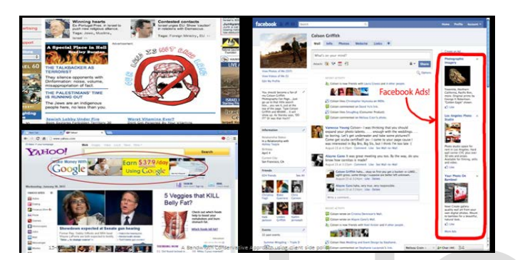
Fig. 1. Regular Webpage

Figure 1 shows the snaps of popular websites where we see that advertises and images covers 40% part of the web page.